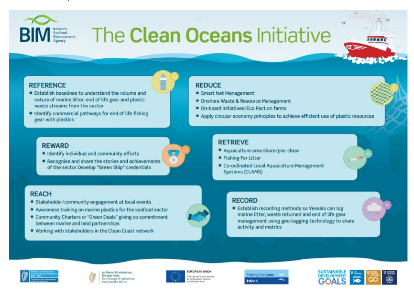
Figure 1: Irelands Clean Oceans Iniative framework

To date 12 ports take part in the programme, and accept marine litter from vessels landing into these ports. 97% of vessels landing in these ports (and targeted by BIM for their operations) have signed up to the Clean Oceans Initiative .